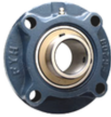
UCFC201-8 Bearing 2D drawings and 3D CAD models